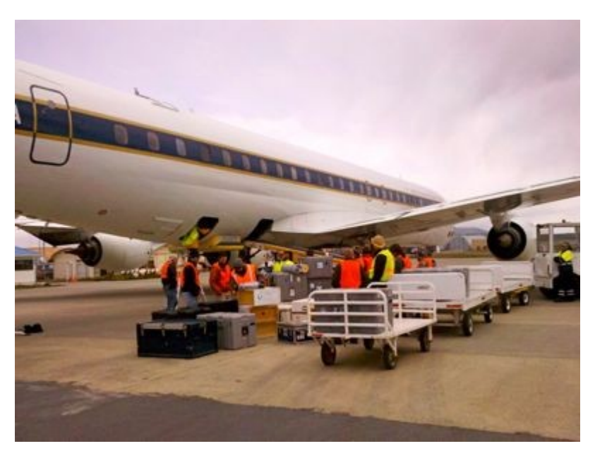
IceBridge teams pack the DC-8 in Punta Arenas, Chile, preparing to return home after the mission's 2010 Antarctic campaign.

downtimes slowed down our progress during the deployment. By adapting our plans to the situation we were able to fly 10 successful missions making use of 84% of the allocated science flight hours. The IceBridge teams have spent 115 hours in the air collecting data and have flown 40,098 nautical miles, almost twice around the Earth. We collected landmark sea ice data sets in the Weddell, Bellingshausen and Amundsen Seas. We have now flown over every ICESat orbit ever flown by completing an arc at 86°S, the inflection point of all ICESat orbits around the South Pole. We have surveyed many glaciers along the Antarctic Peninsula, the Pine Island Glacier area and in Marie Byrd Land. We have collected data along a sea ice transit at the same time ESA's CryoSat-2 satellite flew overhead allowing us to calibrate and validate the satellite measurements.