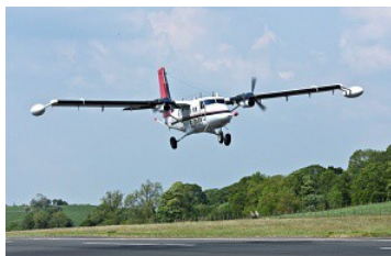
de Havilland DHC-6 Twin Otter equipped for multi-parameter surveys