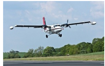
SGL's de Havilland Twin Otter on survey in Ireland

SGL's de Havilland DHC-6 Twin Otter can be configured with a four-frequency wingtip mounted EM system (SGFEM). This configuration results in a large transmitter-receiver coil separation which improves the signal to noise ratio. This allows surveys to be flown higher, thus making the system a viable option for surveying in areas where local regulations restrict minimal flying altitudes.